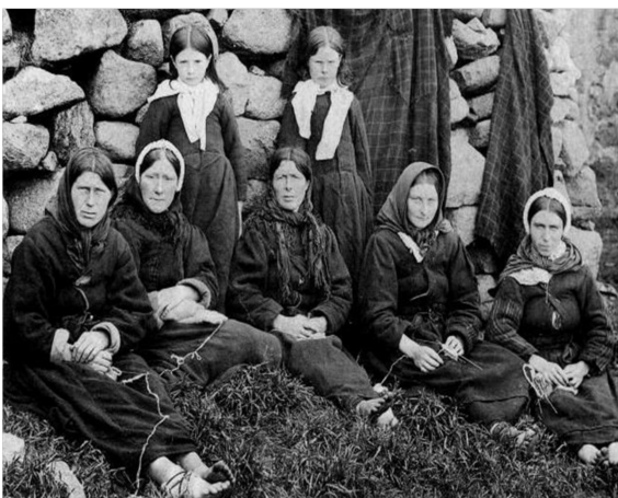
The girls and ladies were distinctive for their centre partings

The St. Kildan ladies were never far from their knitting and weaving.