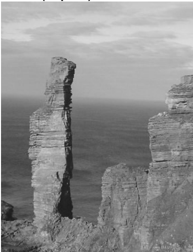
The Old Man of Hoy

Flotta (Pop. 80) is a small island off Hoy, almost adrift in Scapa Flow. The island has had a history of declining farming populations, interrupted abruptly by three ‘modern’ upheavals. At the start of the First World War, the Royal Navy arrived – and a photograph exists, in the Imperial War Museum, of a boxing match taking place on the island in front of 10,000 spectators! In the Second World War, the island returned to military use, again disturbing the quiet community. Despite all this ‘progress’, it took until 1970 for fresh water to be piped to the island from Hoy. The third, and most lasting, upheaval occurred in 1974, when Occidental Petroleum started construction of the island’s oil terminal. This was, for a time, the largest major oil terminal serving the UK North Sea, until Sullom Voe oil terminal in Shetland opened in 1978.