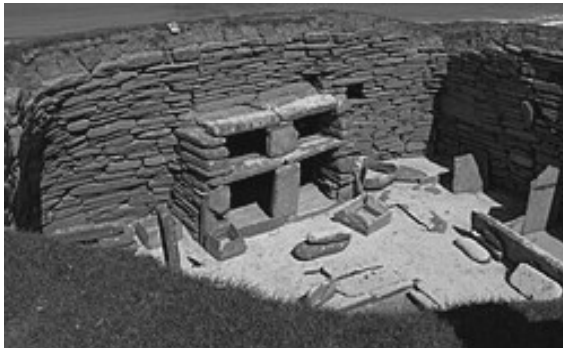
Stone age dresser, centre hearth, bed on the right

Next month: Stromness, Burray, South Ronaldsay