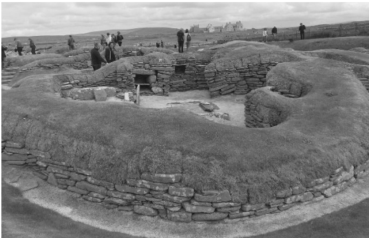
Walking in the footsteps of ancient man!

A road takes you the 6 miles from Maes Howe to Skara Brae, via Stenness and Brodgar: to the casual observer, this is just the plain old B9055, but it is, in fact, a Neolithic Low Road, created to link these ceremonial sites together. Without even getting out of your car, you’re traversing a route trodden by Stone Age man!