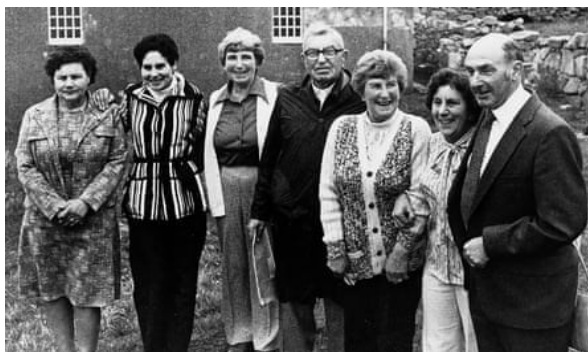
Former residents in 1980, back on St Kilda for the 50 th anniversary of its evacuation

Most of the St Kildans were settled in Lochaline in the Morvern district, opposite Mull. It was chosen for its sparse community and close proximity to the sea – but they had much to get used to: working for a boss, regular hours and earning a wage were all foreign to a community that decided its own hours and shared everything out equally. In later years, some St Kildans revisited their old homes; a reminder of times gone by. Their existence on the island may have been tough, brutal and extreme – but it was home.