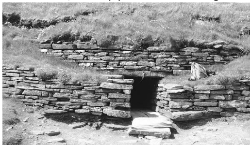
Entrance to Tomb of the Eagles

Ronnie Simison then showed me a burnt mound that he had discovered in 1972: it's the best example of a Bronze Age cooking place in Orkney. Made of flat slabs originally sealed with clay, the central stone trough would have been filled with water heated by stones using peat as a fuel. (After some use, the waste products - heat-shattered stones, ash, and charcoal - are discarded nearby, and these form a 'burnt mound'. Other discarded materials, including kitchen scraps, ash, and other household waste, are referred to as 'middens'. My own cooking efforts, on the other hand, are simply referred to as 'dangerous'!)